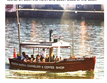
Our little trip boat "Preston Puffin" ran boat trips around the dock and in the river from the Preston Guild in 1992. We carried on running boat trips up to the next Guild celebrations in 2012.