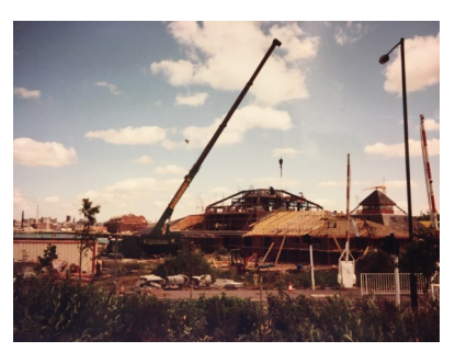
"The Boathouse" under construction in late 1989 - to house the new marina's offices, coffee shop and chandlery, which opened on April 11th 1990.