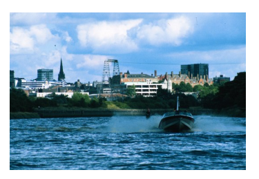
Wakeboarding on the River Ribble with the distinct