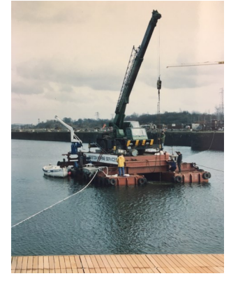
January 1990 - installation of the pontoons using a specially constructed crane barge.

Can you believe it is now 20 years since all those Millennium celebrations?