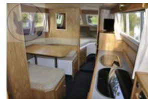
A Viking 26 cruiser, part of the new range of boats available from Preston Marina in 2015.

We are often asked to give advice on how to get started in boating - a question which of course can have many potential answers, but we believe that from 2015 we may have put together some complete package solutions to help people enjoy their own new boats from Preston Marina.