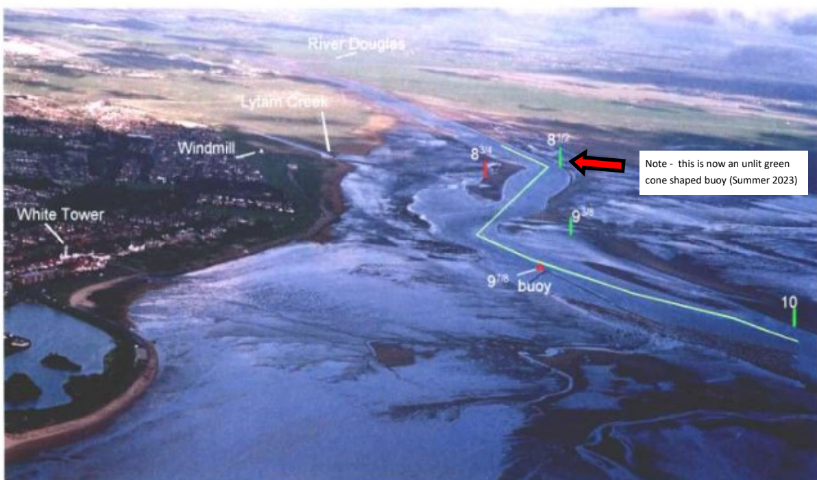
The bend at Lytham at low water, looking EAST