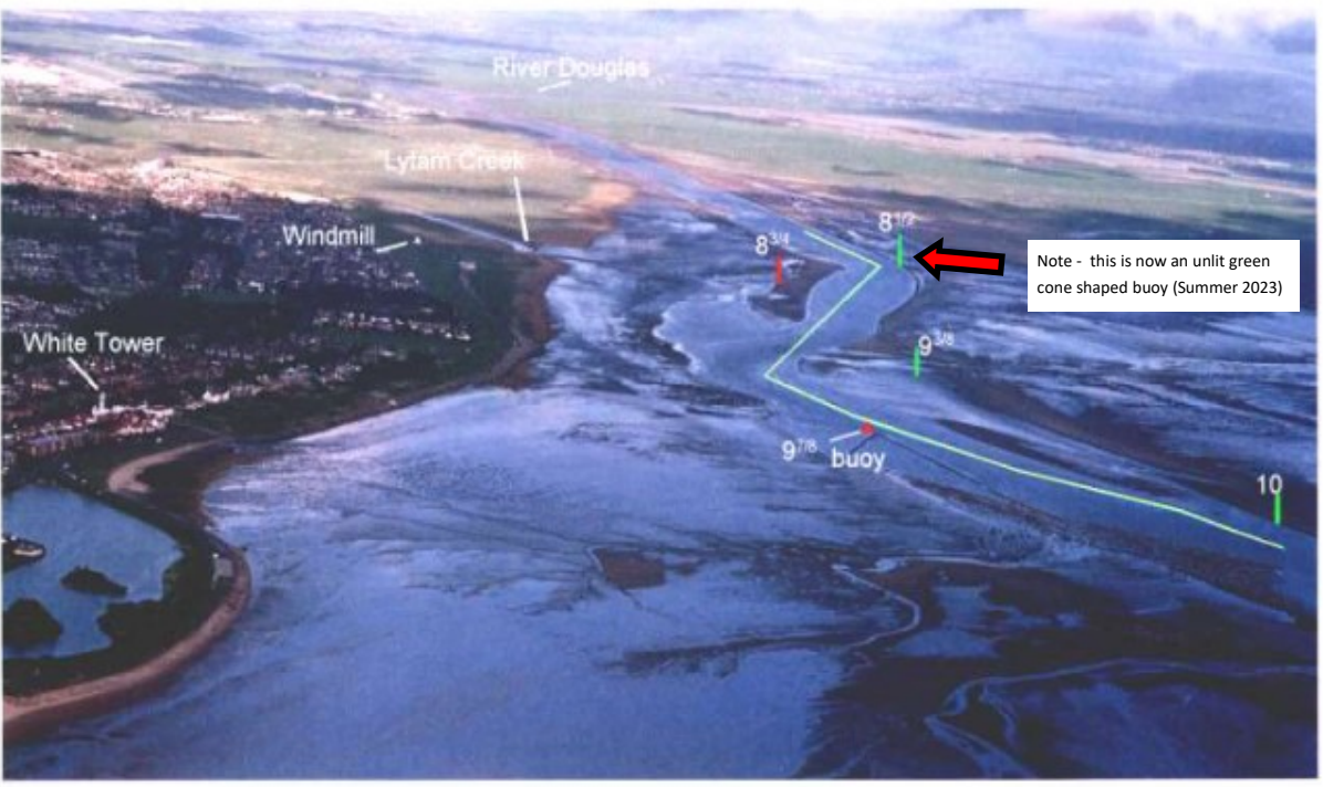
The bend at Lytham at low water, looking EAST