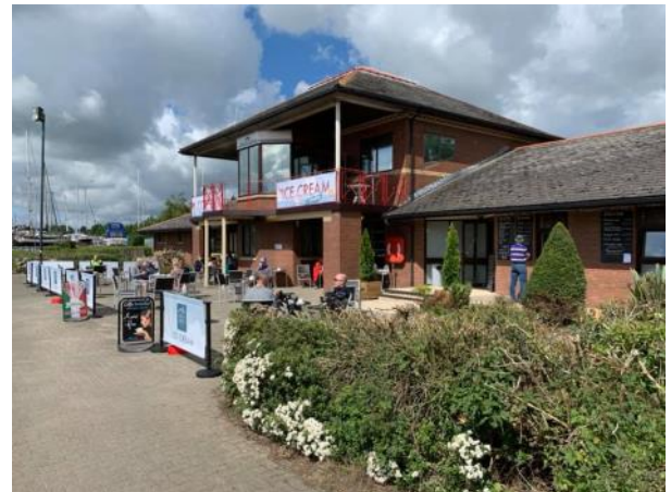
Right; The enforced closure in the Spring enabled us to do a major refurbishment of our coffee shop—adding a licenced bar and pizzeria. More information overleaf.

Despite the lockdowns and the restrictions, a few of us were still able to get out and enjoy some boating in 2020.