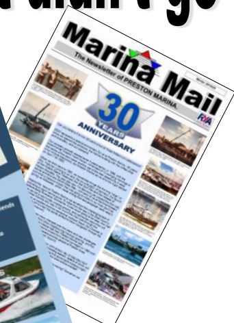
Our cancelled 30th Anniversary Open Day event (left) was to include other local boat companies to help us celebrate.

12 months ago, when sitting down to write our annual newsletter, we were excited to be announcing plans for celebrating Preston Marina's 30th anniversary year in 2020.