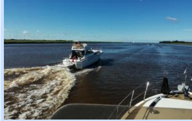
A small flotilla in the river. Summer 2020.

In our newsletter last year we announced that we were hoping to start an informal programme of Cruises In Company in 2020.