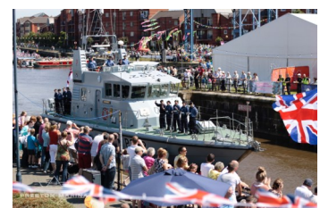
Preston Guild Festival 2012 - Preston Marina has been at the heart of many festivals and events over the decades - celebrating the city of Preston's historic link with the sea.