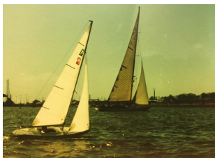
A one-person Mini 12 keelboat races against the real 12 metre Americas Cup yacht "Sceptre", in the 40 acre main dock basin.