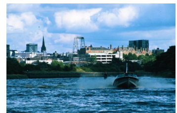
Wakeboarding on the River Ribble with the distinct Preston skyline in the background.