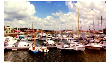
The marina in 1990, shortly after opening. Berths soon filled up as at that time there were very few marinas in the area. A year later we added another row of pontoons, on both the north and south sides of the dock.

Here we are at the dawn of the 20's - will they be roaring? Somehow we doubt they will be boring!