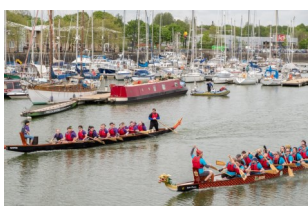
The Preston Dragons - the newly formed dragon boat club goes from strength to strength, the dock basin providing the ideal training facility for this exciting water-sport.

Can you believe it is now 20 years since all those Millennium celebrations?