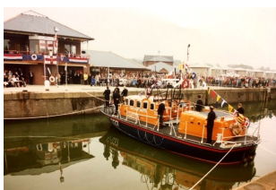
Spring 1990 - the marina opens and soon after the RNLI conduct a commissioning ceremony for the new Lytham lifeboat.