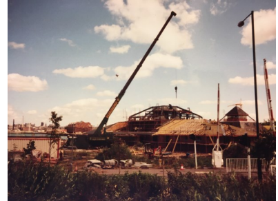
"The Boathouse" under construction in late 1989 - to house the new marina's offices, coffee shop and chandlery, which opened on April 11th 1990.