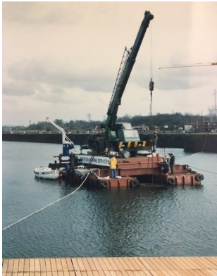
January 1990 - installation of the pontoons using a specially constructed crane barge.