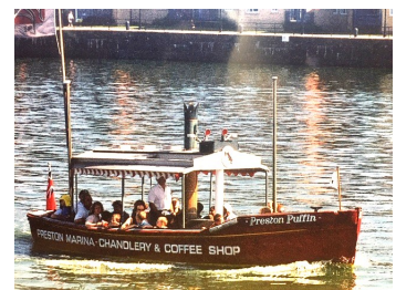
Our little trip boat "Preston Puffin" ran boat trips around the dock and in the river from the Preston Guild in 1992. We carried on running boat trips up to the next Guild celebrations in 2012.