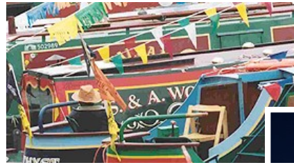
Images from previous Preston Riversway Festivals.

So a busy year ahead - and if the Mayans are right, we are hoping the end of the world comes as a flood!