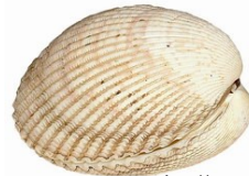
A cockle, yesterday