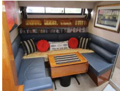
Lower saloon—which can convert to another double berth. Galley to starboard with gas oven, 4 burner hob, 2 sinks and fridge.