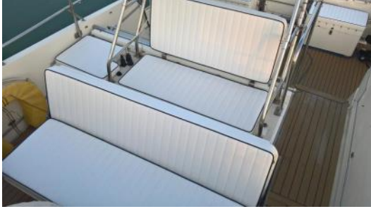
New vinyl upholstery to flybridge.

Web site: www.prestonmarina.co.uk E-mail: info@prestonmarina.co.uk