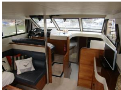
Deck saloon—which can convert to another double berth. Master helm to port. Cabinets to starboard.