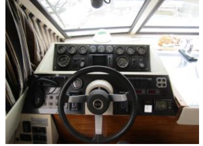
The master helm position