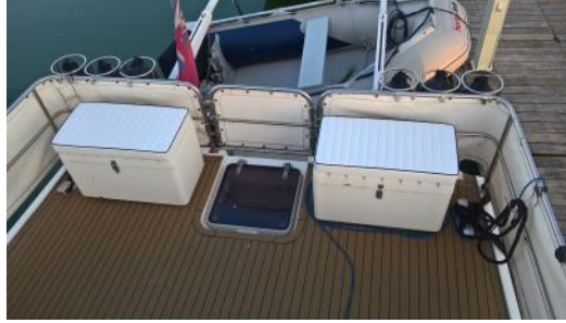
The stern deck - teak effect to all deck surfaces.