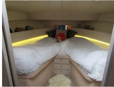
Forecabin with large V-berth. Note the LED "mood" lighting. Central heating to all cabins.