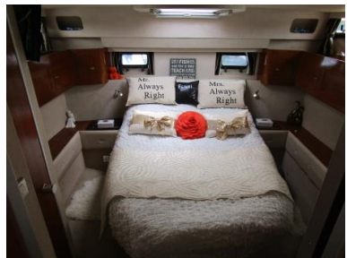
Owner's aft cabin with island double bed. En-suite WC and separate en-suite shower room. Central heating.